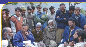
Need assessment studies enabled CEE to develop comprehensive rehabilitation plans

CEE has worked with local communities in relief as well as long-term rehabilitation programmes in disaster-affected areas. Through its efforts, CEE has created awareness on disaster preparedness so as to ensure vulnerability reduction.