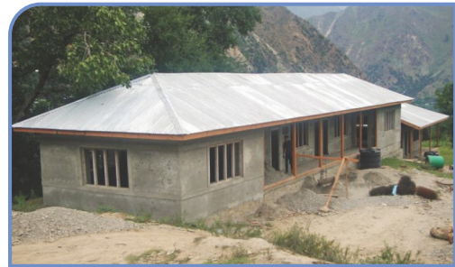
School constructed towards rehabilitation in Kashmir.